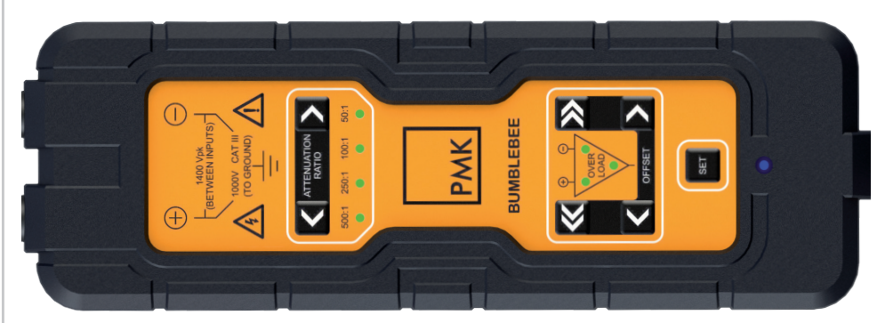
Keyboard Layout - BumbleBee®

See 889-09V-PS2 and 889-09V-PS3 for more information on PMK Power Supplies available at <a href="http://www.pmk.de/en/products/ps02">http://www.pmk.de/en/products/ps02</a>